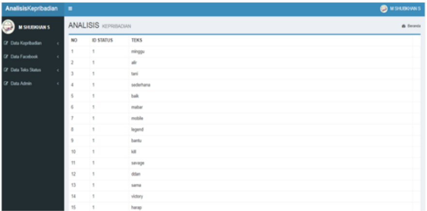
Fig.4. Data Status Menu Page

On the Facebook data menu page on the right, there is an edit and delete link. In the edit can not be used because the data input is valid and has obtained the personality category obtained from the questionnaire results and has been calculated by the psychologist method. To delete the link can be used because it will delete the whole meaning that the data is no longer entered into the database. The Status Data page in Fig.4 contains words from all statuses in the training data that has been through the text processing process, which in the process produces standard words or important words that are used to analyze a person's personality.