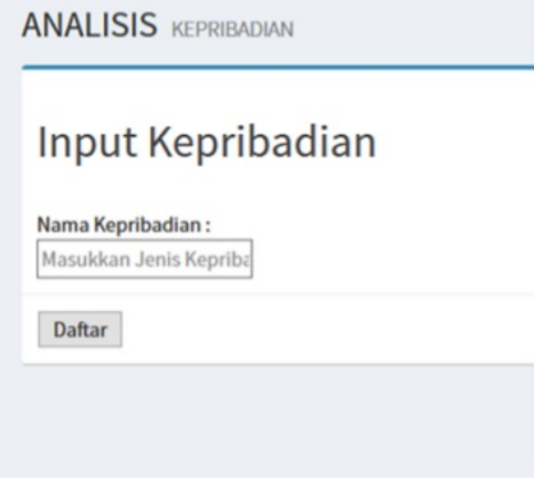
Fig 2(a). Personality Data Edit Form