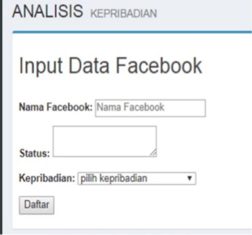
Fig.3 (b). Form Input Data Facebook