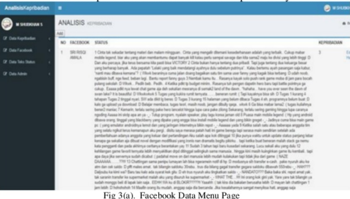
Fig 3(a). Facebook Data Menu Page

In this Facebook data page menu in Fig.3 (a), the admin can add Facebook data, by selecting the add button at the top. In the Facebook data, input form admin enters the Facebook name data by the user ID name on Facebook, to input admin status enter the pure status text does not need to be deleted or added, although the status of the word used is not by the spelling and symbols symbols that are used do not need to be deleted. Because the status data entered will be processed with text mining and will produce basic words. Then the admin enters the personality that has been inputted on the personal input form, and the admin just has to choose the dropdown button that matches his personality as seen in Fig.3(b).